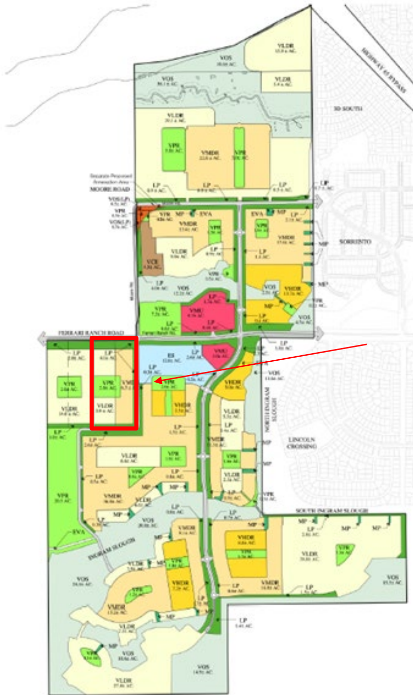
Figure 4-1: Land Use Plan