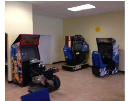
Kids Area / Arcade